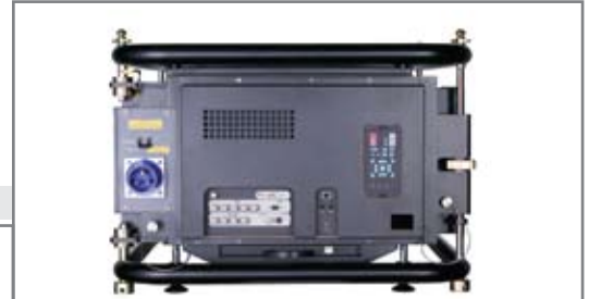
LIGHTNING Reference 1080p Back Panel